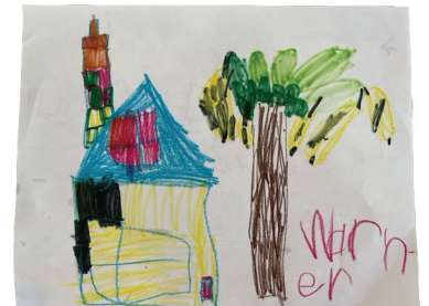
Warner Fredland, 4