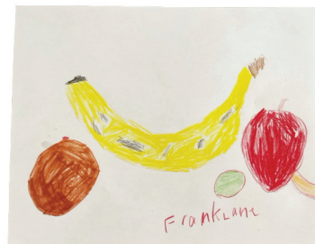
Frank Lane Fredland, 6