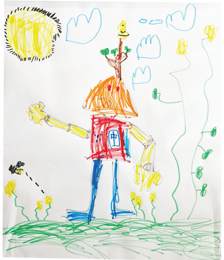
Nicolaus Peña, 6