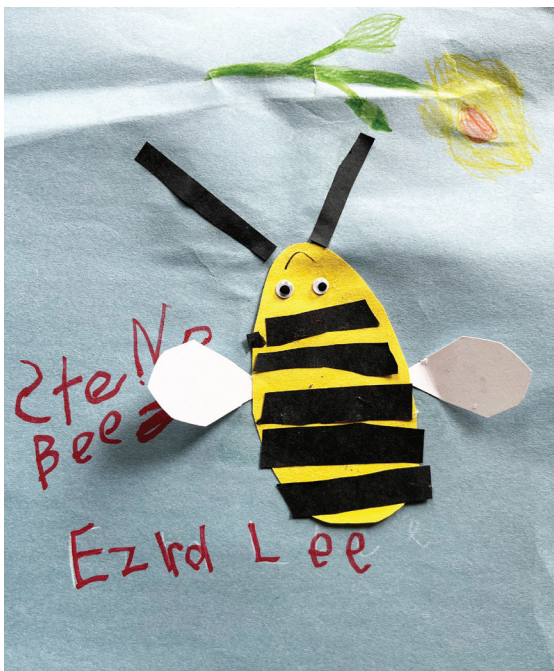
Ezra Lee, 5